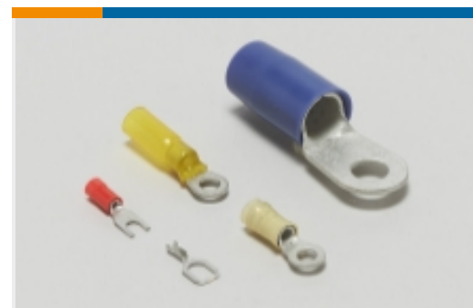
Ring Terminals & Spade Terminals(537)